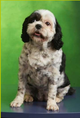
Bella Wilton Deer